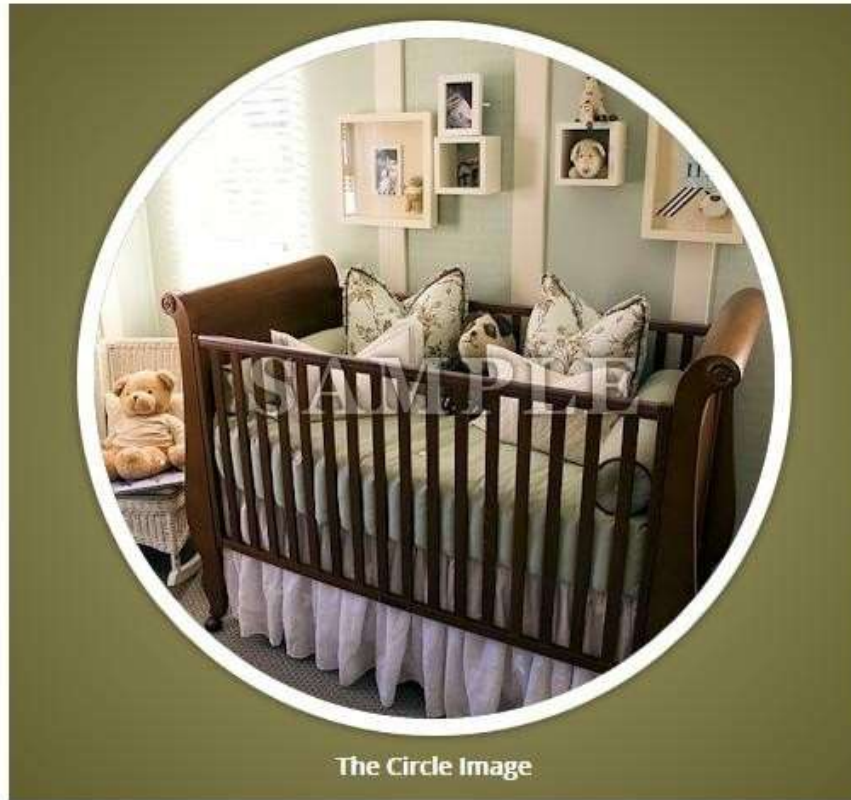
The Circle Image

shadow. Our image is 400px x 400px. Because we also want this image to contract in size on smaller devices, we first have to place the image into a <div> where we can control the width of the box.